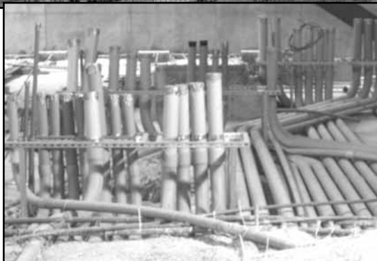
Feeder conduit for electrical room switchgear