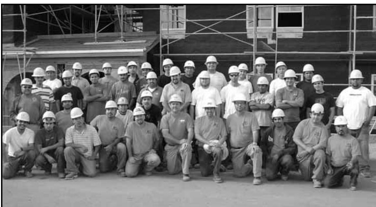
APOLLO CREW AT JOB PEAK (Nov. '05)