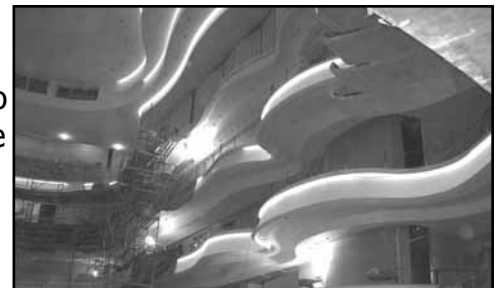
Performing Arts Center Looking up at balconies inside Concert Hall

In closing, I am very pleased to report that one of our very notable jobs – the Orange County Performing Arts Center